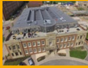
SINGLE PLY ROOFING