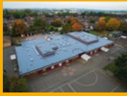
LIQUID APPLIED ROOFING