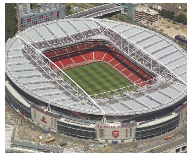
SPORTS AND STADIA