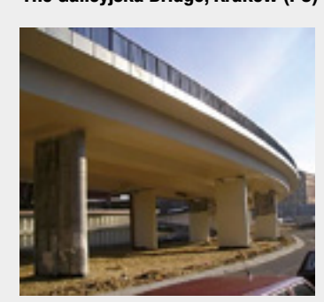
Long-lasting protection: Concrete protection with Sikagard® elastic and rigid protective coatings.