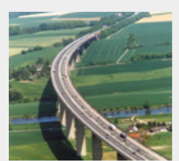
Complete bridge maintenance: Full deck refurbishment of the bridge with SikaTop ® repair mortars, deck waterproofing using Sika® Decking system