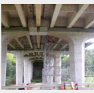
Structural maintenance: Structural Strengthening during traffic load with Sika® Carbodur® systems, surface protection with Sikagard® protective coatings.