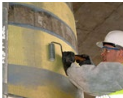
INCREASING IMPACT RESISTANCE