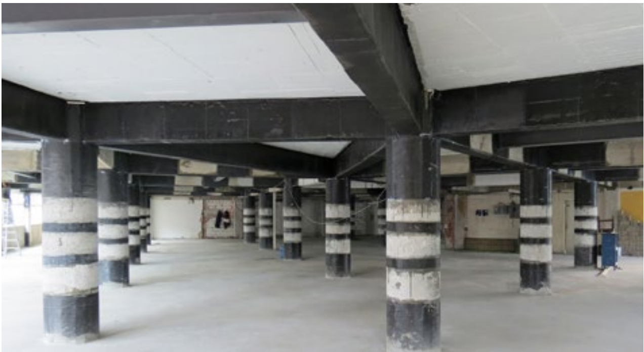
Beams and columns strengthened with SikaWrap®

International Concrete Repair Institute (ICRI): Sika won the ICRI Award of Merit in the Low-Rise Category in 2013. Click on the QR Code to learn more about Sika's ICRI Award-Winning Projects