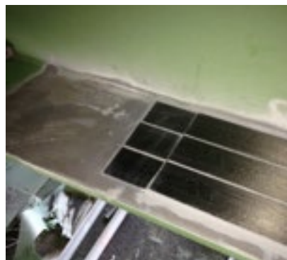
Two layers of Sika CarboDur®