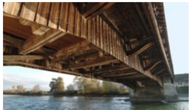
Bottom view of strengthening system