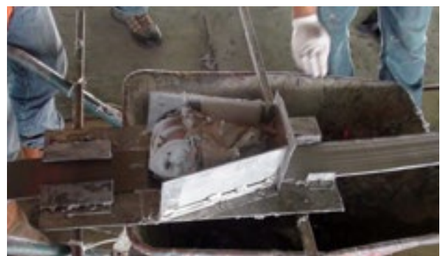
Coating of CarboDur® plates with Sikadur®