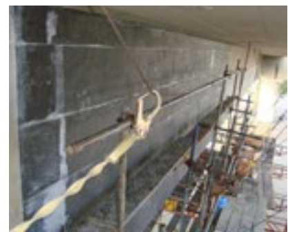
Strengthening with SikaWrap®