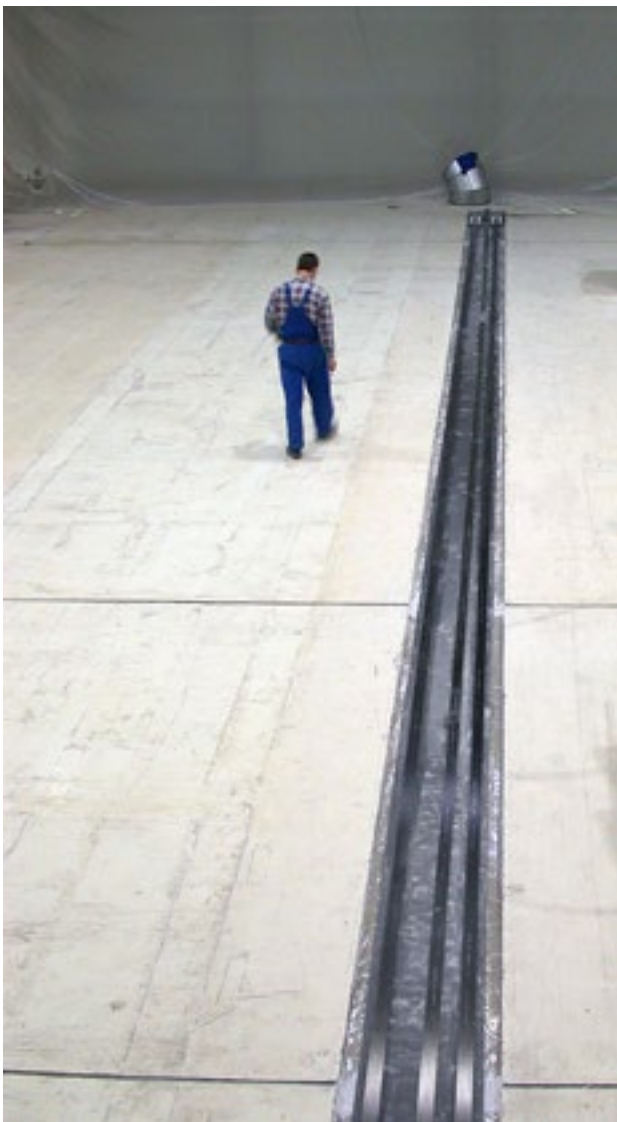
The longest post-tensioned CFRP-plates ever installed

With 29 m this is the one of the longest post-tensioned CFRP plates ever installed in the world.