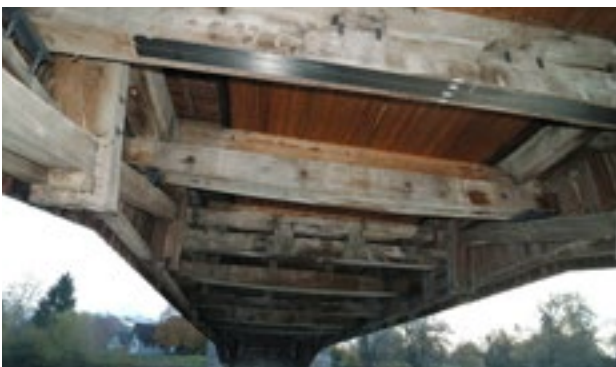
CarboDur® strengthened crossbeam