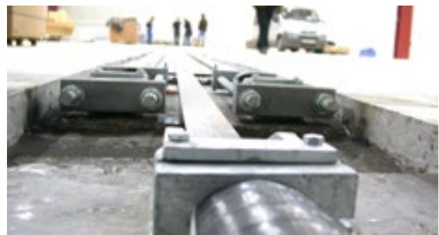
Base channel with post-tensioned CFRP plates