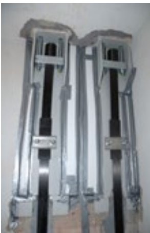
Anchorage of Sika CarboStress System