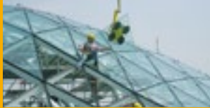
SEALING AND BONDING