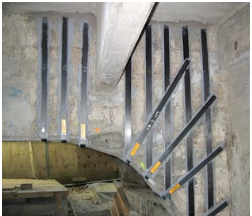
Sika CarboDur® strips and CarboShear L plates bonded to the concrete structure.