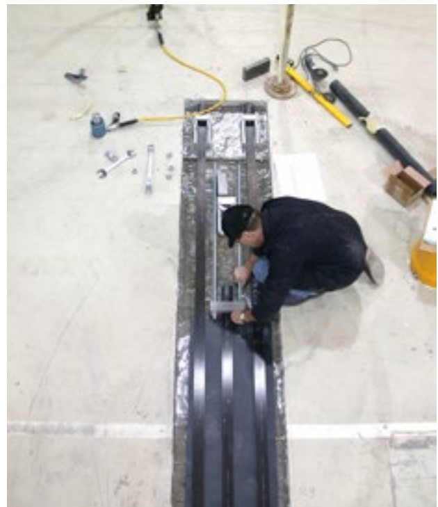
Plate and end-anchorage