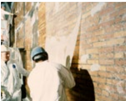
SEISMIC UPGRADING /EARTHQUAKE DAMAGE REPAIR