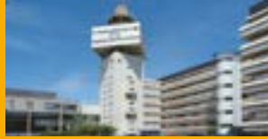
REINFORCED CONCRETE BUILDINGS