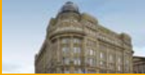
STEEL FRAMED MASONRY BUILDINGS