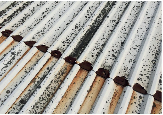
Corroded roof sheet

Sika® Pro-Tecta CE has been developed and tested as an effective surface treatment for the onset of cut edge corrosion, designed to extend service-life, where the sheets remain structurally sound, and the primary waterproofing function has not been compromised.