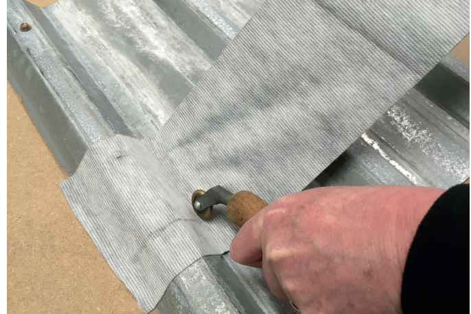
Sika® Joint Tape SA

Key to the enhancement of our waterproofing system is the incorporation of a new and innovative self-adhesive tape called Sika® Joint Tape SA. The tape is used as a single-solution for the reinforcement of side-laps, end-laps, and bolt-heads, prior to the application of our liquid coatings, without the need for additional specialist reinforcement coatings.