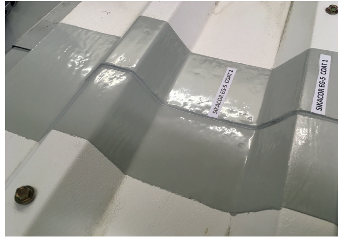
Sika® Pro-Tecta CE

Sika also offers a range of non-waterproofing, full maintenance coatings for metal roof systems, available in a variety of different colours. Contact your local Area Technical Manager or Sika Technical Customer Services for more information.