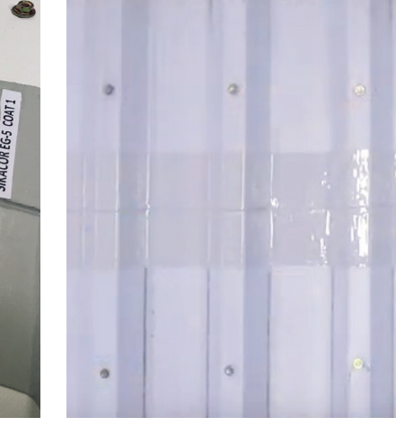
Sika® Pro-Tecta CE

*check with your local Area Technical Manager