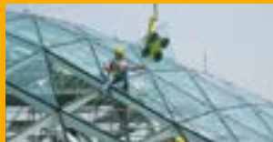
SEALING AND BONDING