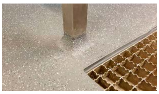
Kitchen and wetrooms