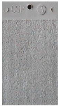
CSP-3: Light Shot Blast