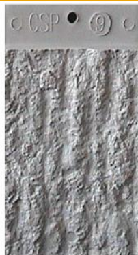
CSP-9: Heavy Scarification

After grinding or sandblasting, the surface must be cleaned of all loose particles and dust. Brush the dust out well with a dry brush and use a vacuum cleaner. The use of compressed air is not recommended, as it will push the loose particles into the concrete instead of removing them.