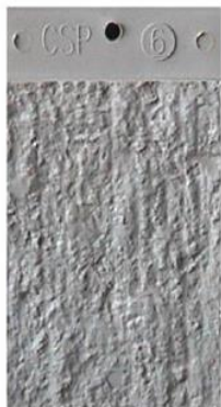
CSP-6: Medium Scarification