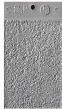
CSP-5: Medium Shot Blast