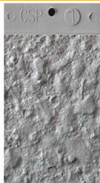
CSP-7: Heavy Abrasive Blast