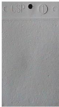
CSP-1: Acid Etched*