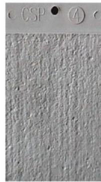
CSP-4: Light Scarification