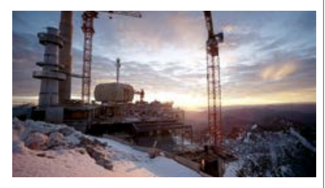
Improved Early Strength in Cold Weather Makes it possible to work at lower temperatures