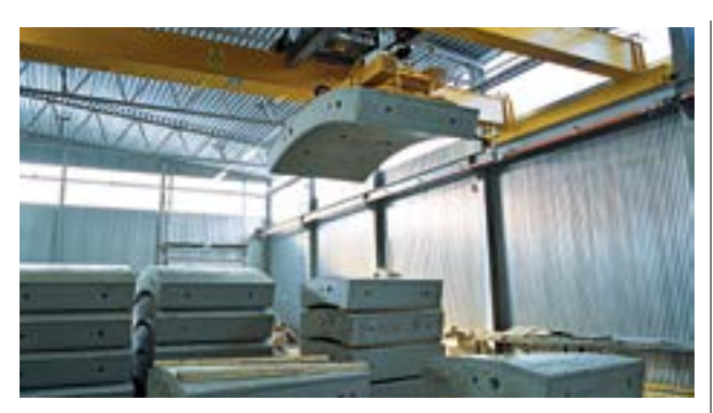
High Early Strength for Precast Concrete Saves energy and reduces production and material costs