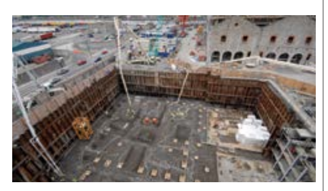
Enhanced Pumping Properties

Increased pouring speed and reduced wear of equipment