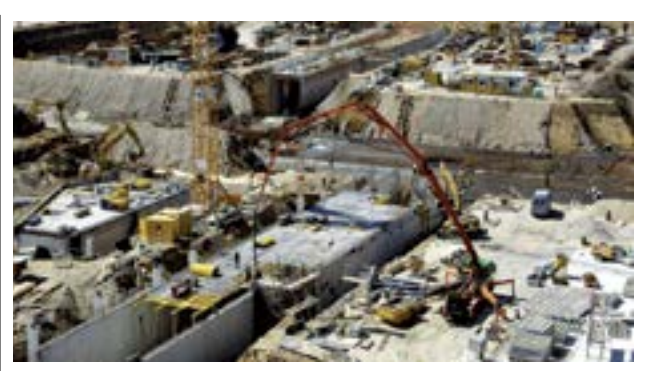
Reduces Pump Pressure

Reduced labour and manpower with easy and consistent placing of the concrete