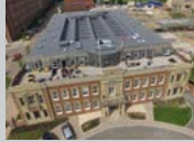
SINGLE PLY ROOFING