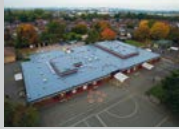
LIQUID APPLIED ROOFING