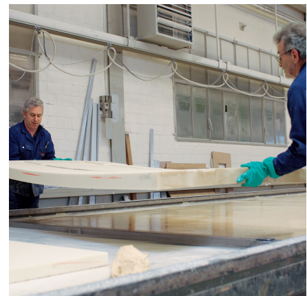
Positioning of the core foam

Reactive hot melt PUR adhesive for a range of panel lamination and with extremely fast cycle times