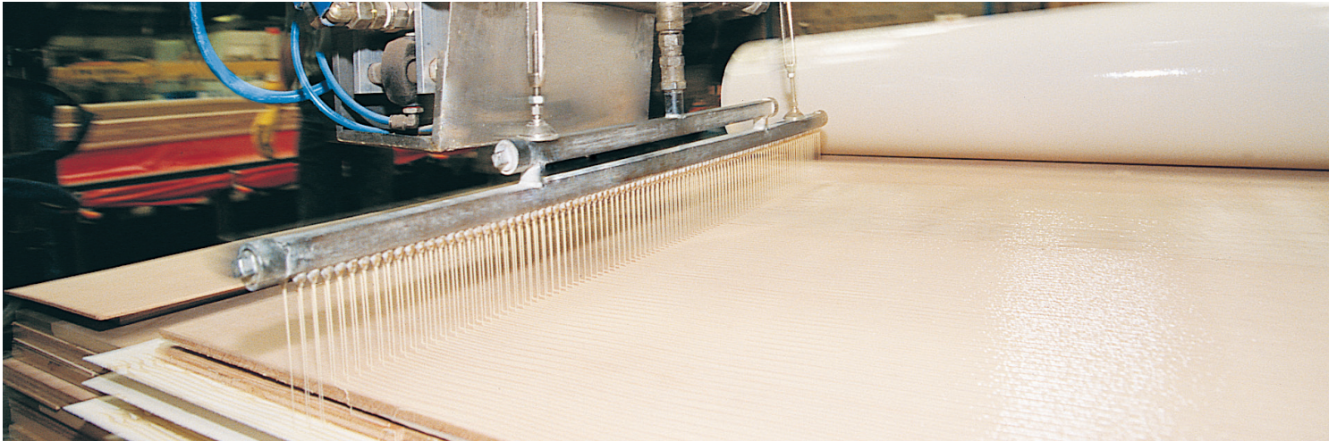
SikaForce® applied by spreader bar