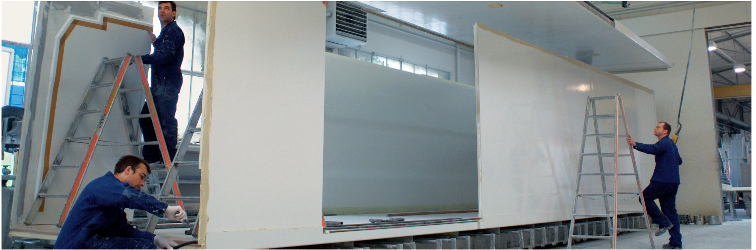
Assembly of the box