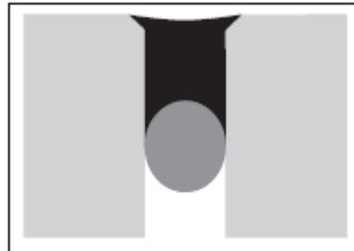
Flush joint design prevents trip hazards and dirt traps

Backing: Use closed cell, polyethylene foam backing rods.