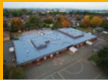
LIQUID APPLIED ROOFING