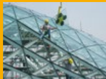
FAÇADE STRUCTURAL ADHESIVES