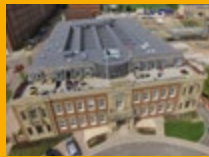
SINGLE PLY ROOFING