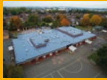
LIQUID APPLIED ROOFING