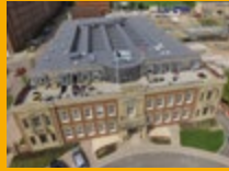
SINGLE PLY ROOFING