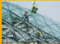
FAÇADE STRUCTURAL ADHESIVES