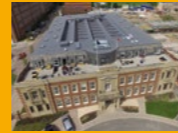
SINGLE PLY ROOFING