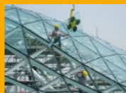
FAÇADE STRUCTURAL ADHESIVES