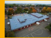
LIQUID APPLIED ROOFING