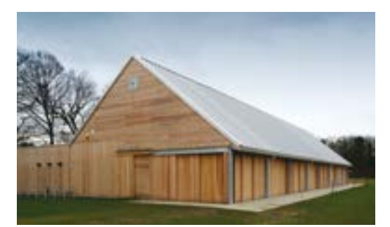
New floor for changing area ↑ Outside of new pavillion 7